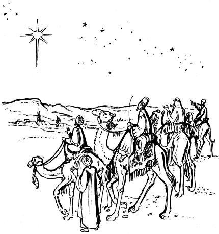
Te hetuuraa e haere imua na tamaraa. (2.9–10)

6 ‘Betlehem etuu i roto Judia, akoe he matakaina e hakanaaniu hoki i roto na matakaina Judia raa, maitaname he tama hakanaaniu e me ki haanau iho i te kina naa; he tama e me ki hakattaki Israel te kanohenua Anau raa.’ ”