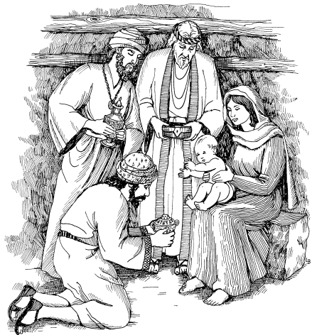
Na tama mattonu raa kukkite Jisas. (2.11)

12 Kito na tama raa ki tauttari teeraa mateara no vakkai i te matakaina laatou raa, maitaname TeAtua ni tattara ake na tama raa i roto te miti ma ki se lavaa te vakkai iaa Herot raa.